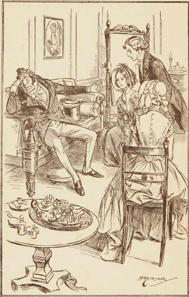
Mr. Turveydrop receives a Shock